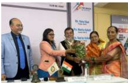
Felicitations of President and Secretary of RCC, Haripur