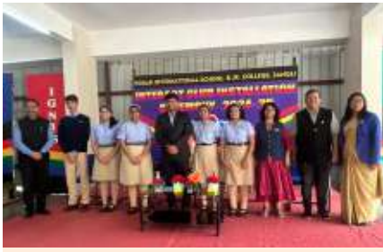
New office bearers