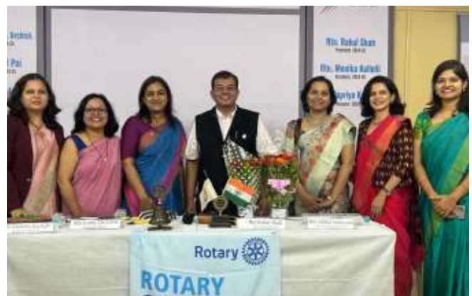
With President and Secretary