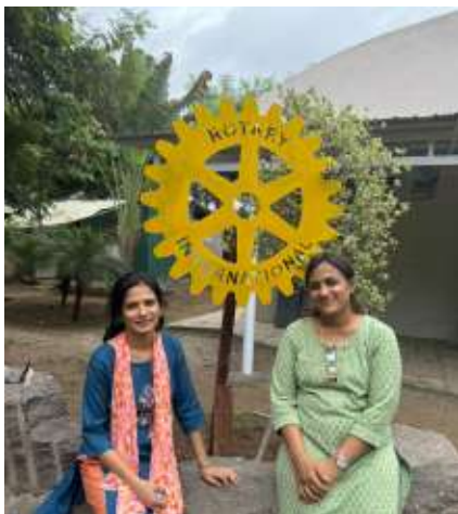
New Rotary Wheel

The club hall is renovated. Also cleaning of the surrounding area is done, new shade in the front of the hall is and new rotary wheel is installed. Rotary posters are placed in the hall.