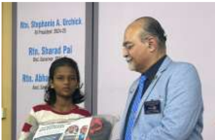
Mementoes to Milestones