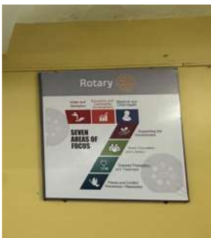
Poster with 7 areas of focus