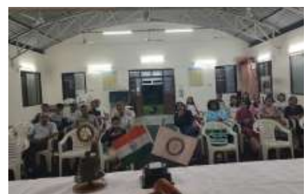
Attendees for the event