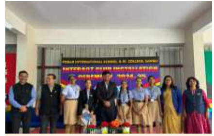
New office bearers