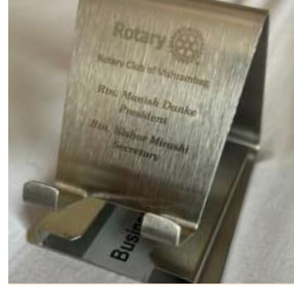
Useful gift (mobile stand)