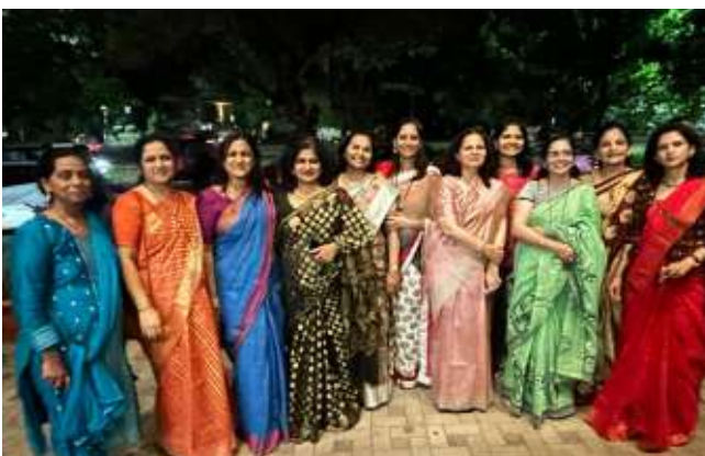
Enjoying the installation ceremony