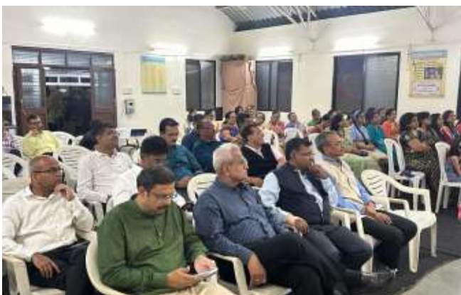
Audience for the function