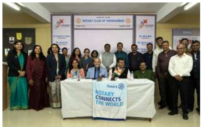
Team for 2024-25