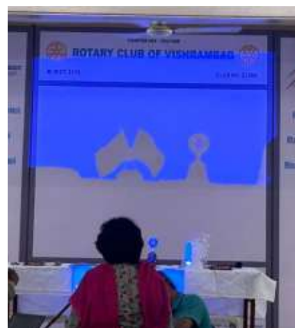
New banners and Projector Screen