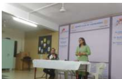
Secretary briefing the topic