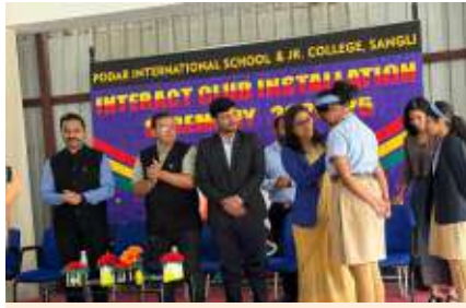
New office bearers