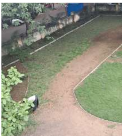
Cleaning of Surrounding area