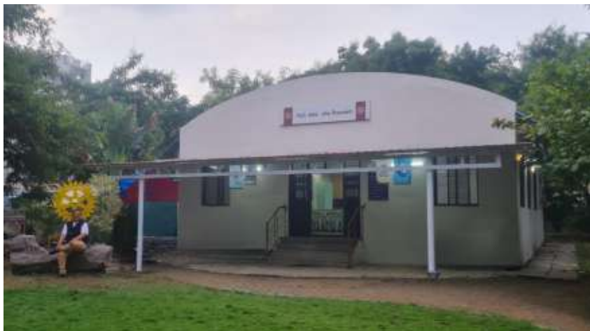
New shade in the front of hall