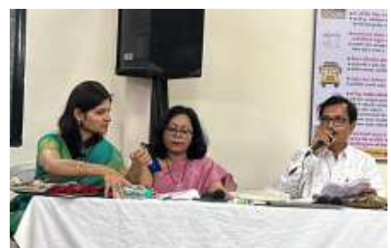
Anchors of the program