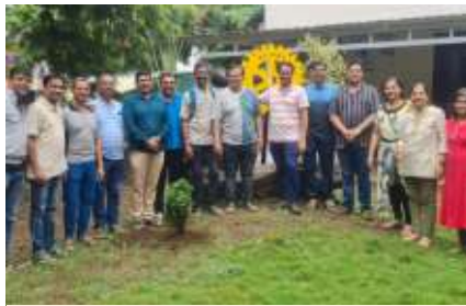
Rotarians enjoying the Event