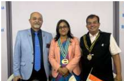
Secretary and President with DG