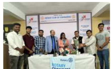
With Sahyadri Pashan Rotract Club, Palus